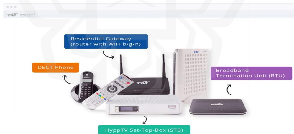
Figure 1.1 TM-Unifi Package Promotion