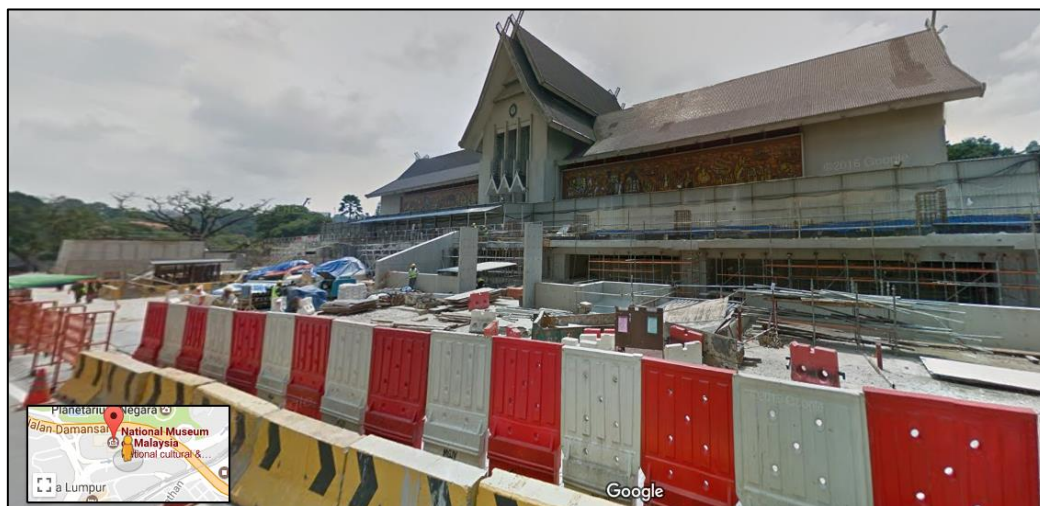
Figure 1.2. The Construction of Mass Rapid Transit (MRT) at The National Museum, Kuala Lumpur.

The second approach is developing the sampling protocol. A multi-point sampling system was designed and chosen inside Gallery A, Gallery B, the Lobby and near the main entrance of the museum. 7-holes sampler head and Cyclone sampler head were selected to collect the sufficient amount of airborne particulates for