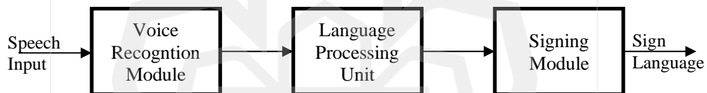
Figure 2.1 The Sign Language Synthesizer Module

The voice recognition module captures data from the speech input. The second module is the language processing unit, which alters input language from the first module into suitable output language with sign language. The third module is a signing module where sign movement appears in some possible method, such as avatar, recorded video, or hand robot movement.